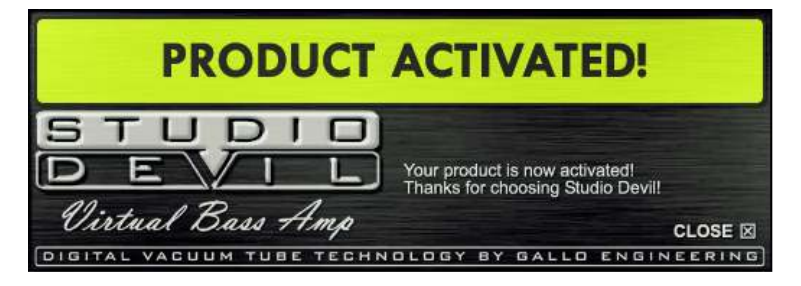
Click CLOSE to begin using Studio Devil!

9. That's it! Your Studio Devil plug-in is now activated!